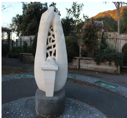
Photo days are Thursday 7 th September and Friday, 8 th September . All photos must be paid for by tomorrow Tuesday, 5 th September . This will allow all payments to clear before photo day.

There will be no late payments taken after photo day.